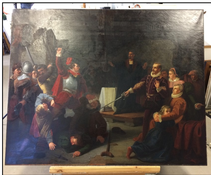
The painting on the work stand in the studio

ments over the same areas need to be done in order to complete the work.