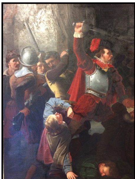
Detail of lower left hand corner after one treatment

The sections of the painting that have been worked on show a striking difference in color, brightness, and luminosity.