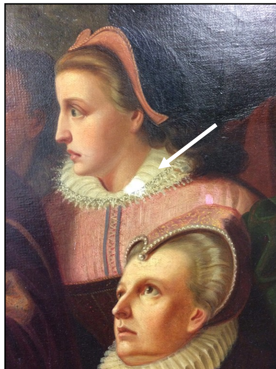
Detail of lower right side showing the difference in color and brightness of the woman's collar, treated area vs untreated, white vs dull beige.

and you can now see figures and items - such as the soldier wielding a musket - that had not been visible before. All are excited to see the finished product.