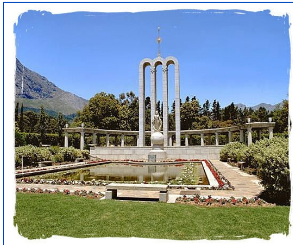
The Huguenot Memorial at the Huguenot Museum in the Republic of South Africa.

The legacy is that of the 36 most common surnames of the white population of the Republic of South Africa, nine are of Huguenot origin. Today Huguenot descendants are active participants in every facet of South African Life.