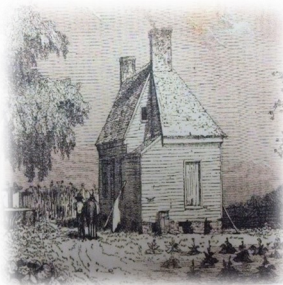
President Monroe's home.

It was held on a beautiful but windy day that made keeping the many memorial wreaths on their stands a challenge. Many more people attended this ceremony than in years past, according to the docents.