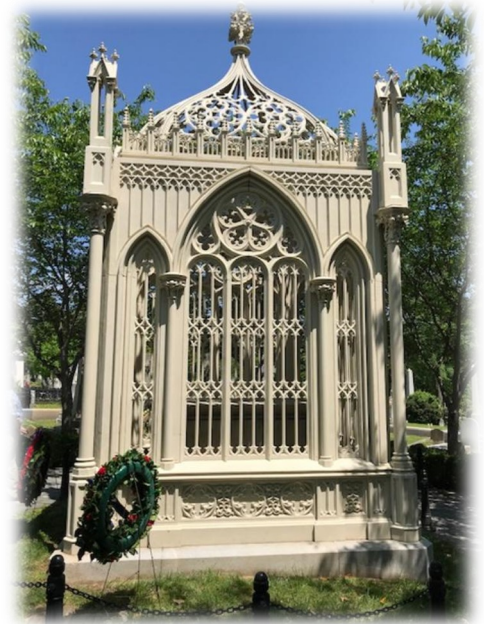
Tomb of President James Monroe Hollywood Cemetery, Richmond, VA