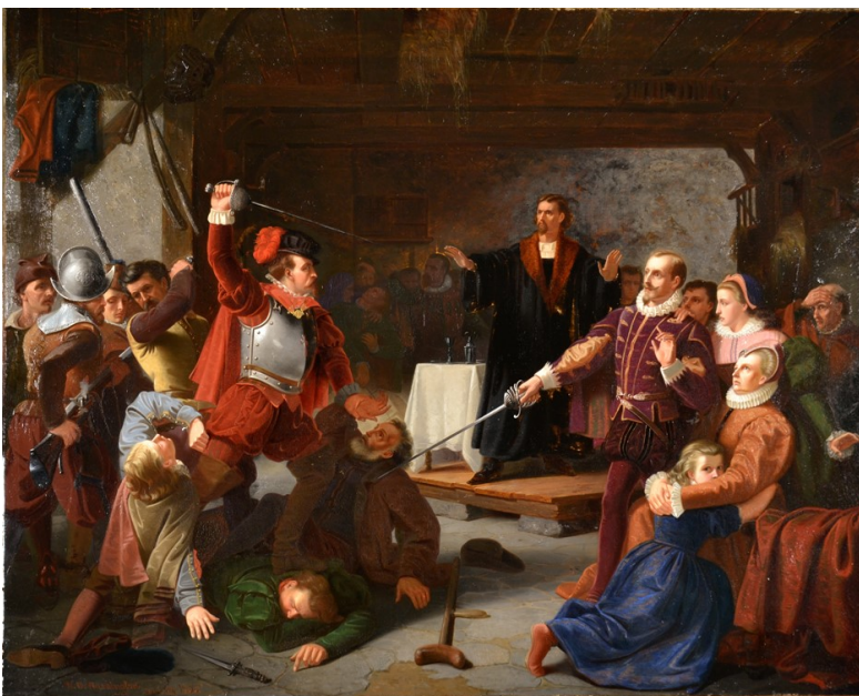
"Attack on the Huguenots"