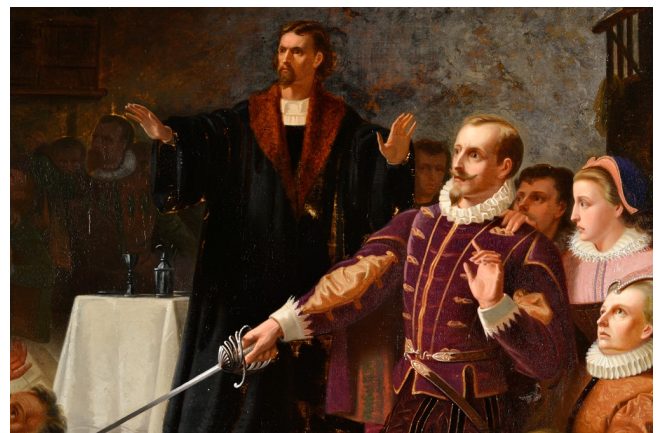
"Attack on the Huguenots" in detail

Where or how the painting will be displayed in the interim has not yet been determined.